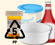
#4-#7 Plastic Containers