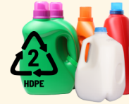
#2 & #3 Plastic Containers