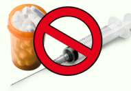
Sharps and Medicine