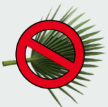
No Palm Fronds