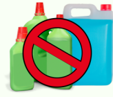
Anti-Freeze & Pesticides