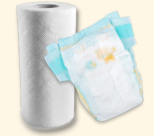
Diapers & Paper Towels