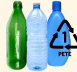
#1 PET Plastic