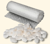
Styrofoam, Plastic Film, Plastic Bags