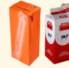
Juice Boxes & Milk Cartons