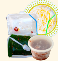
Plastic Utensils, Straws, Dirty Take- Out Containers